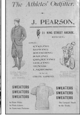
Cycling fashion in late 19th century