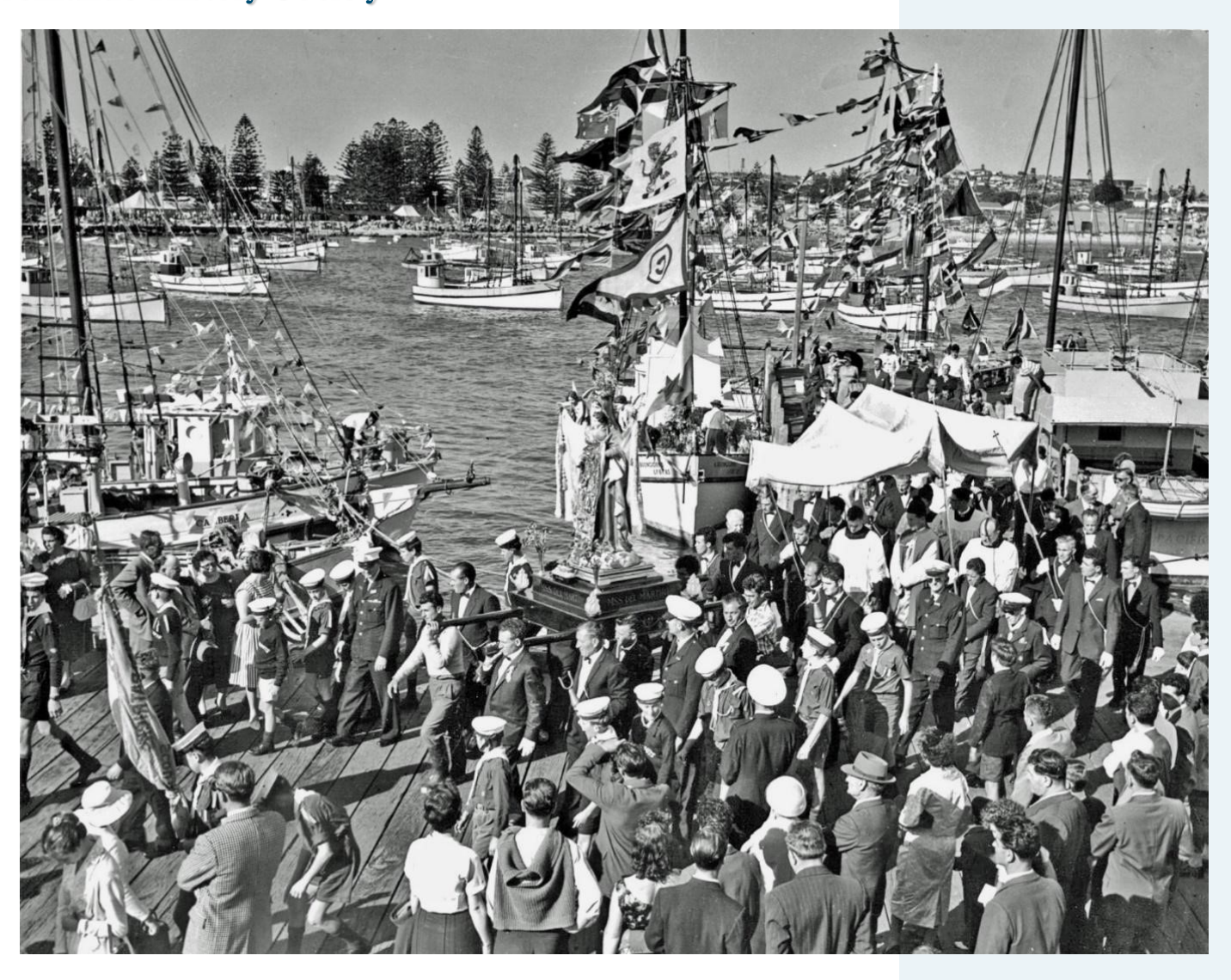
Fremantle Fishing and Blessing of the Fleet

The Fremantle Fishing Fleet Festival Committee invites you for an afternoon celebrating the rich legacy of Fremantle's Blessing of the Fleet and the Western Rock Lobster Fishing Industry as part of the 2025 City of Fremantle Heritage Festival.