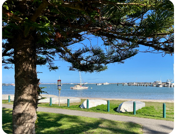
A midwinter morning in Port Denison, 2024

The Conference is being held over the weekend of 6-7-8 September 2024 at The Priory Hotel in Dongara. The conference theme is 'Waves of Change', which partly refers to the diverse maritime and fishing heritage of Dongara and Port Denison, and partly to looking at new developments and ways of doing local history and local museums. Both strands are woven through the draft (but almost final) program shown on the next pages.