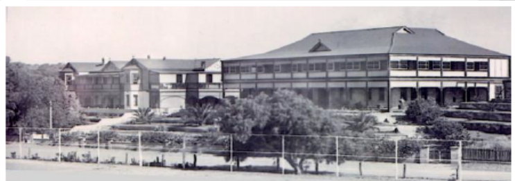
St Dominic's Priory & Dominican Ladies College, c1930 IRME1341

The Conference will be held in the recently conserved and renovated Priory Hotel, which was built in 1881 as the Dongarra Hotel and later served as the Dominican Priory and Ladies' College for 50 years. The weekend will be a celebration of local history and heritage and will include a Welcome Event at Port Denison; lively presentations on the theme of Waves of Change ; a range of walking, bus and driving tours to places of historic significance; and a Conference dinner, plus great networking!