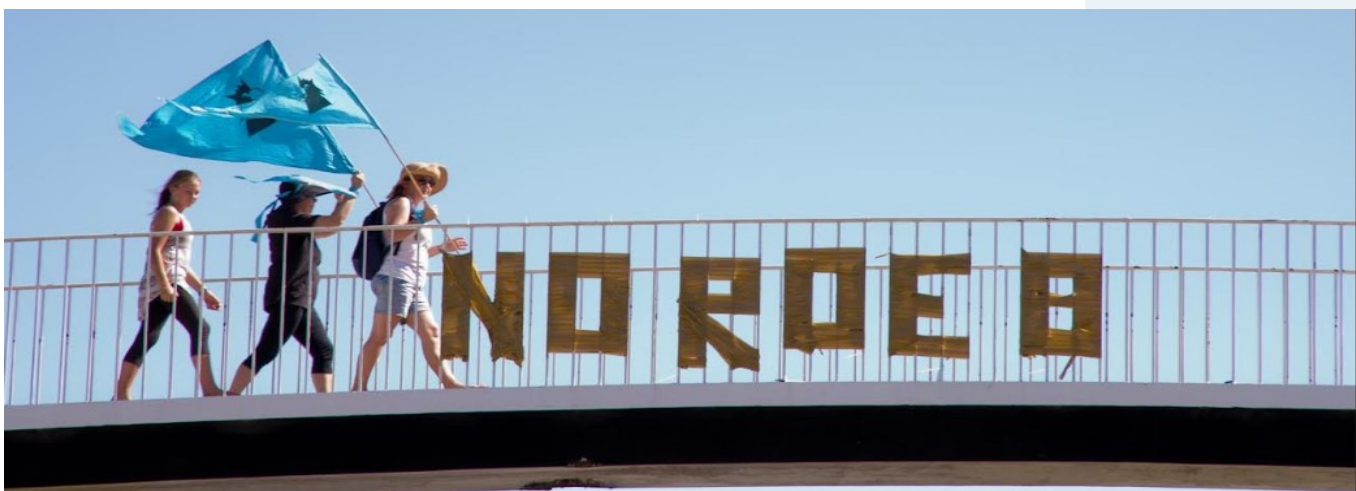
"No Roe 8" on the bridge opposite Hamilton Hill High School, 2017.