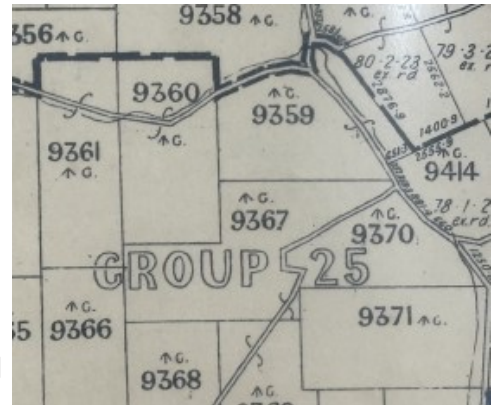
Excerpt from 442B/40 map, dated 22/01/1924

JM Cheetham was placed on location 9367 in November 1922. However it also shows that settler Cheetham was dismissed from the group on 19 June 1928.