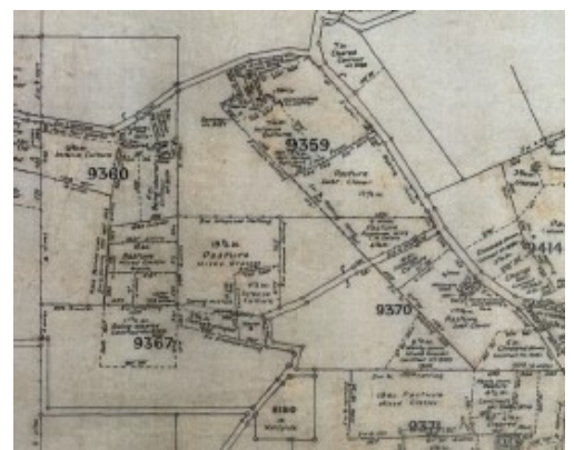
Excerpt from Group 25 map, c. 1928