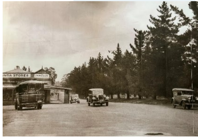
Railway Road looking north a few years later