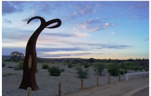
Yagan Memorial Park