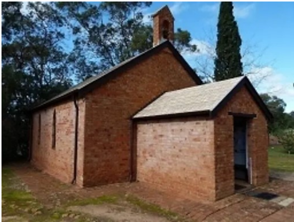
St. Mary's Church, Henley Brook

The day was a huge success, enjoyed by all who participated. Swan Guildford Historical Society will be repeating similar tours soon.